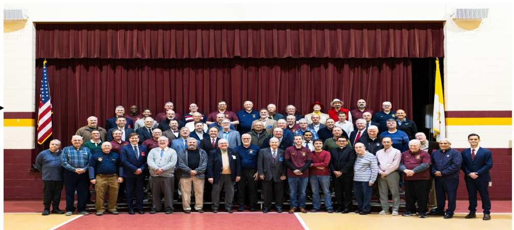
100 Man Initiative 2025