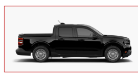
2026 Ford Maverick Truck