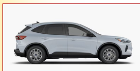
2026 Ford Escape