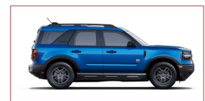
2026 Ford Bronco Sport