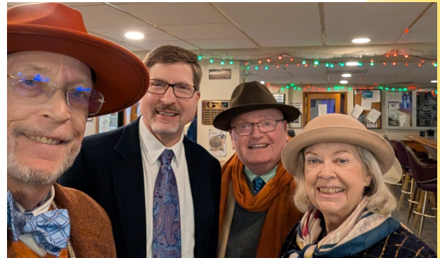
Christmas Festivities 2025